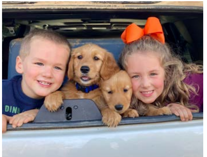
Bringing home new puppies