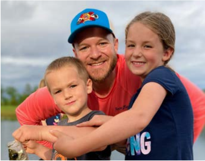
Fishing with Daddy