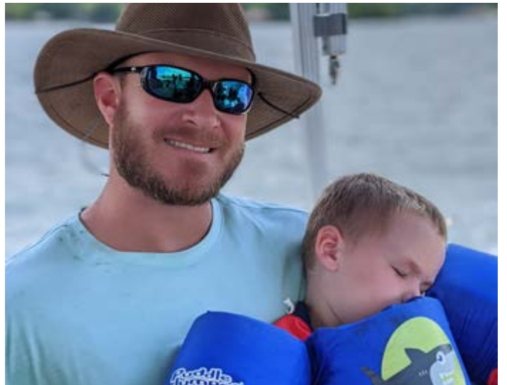
A day out on the boat