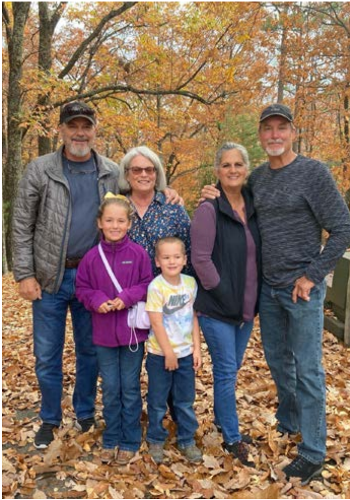
Smoky Mountains with the Grandparents