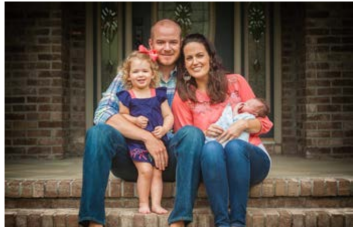
Bringing home a new brother