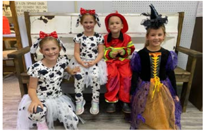
Trick-or-Treating with Cousins